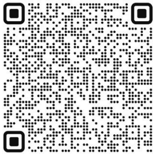
Year 1 Registration QR Code

Our program will be in person in the Parish Center on Sundays from 6:00-7:15 PM, with attendance at the 5 PM Mass before.