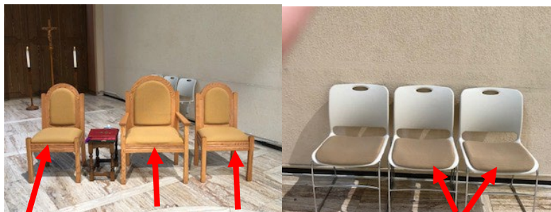
Book Bearer Celebrant Cross

Book bearer bows at the bottom of the stairs then goes to stand behind the chair to the right of the celebrant. Cross bearer stands behind the chair to the left of the celebrant. Candles sit in the altar server chairs against the wall.