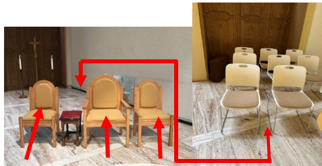
Book Bearer Celebrant Cross Candle Bearers and Others

Book bearer bows at the bottom of the stairs then goes to stand behind the chair to the right of the celebrant. Cross bearer stands behind the chair to the left of the celebrant. Candles sit in the altar server chairs against the wall.